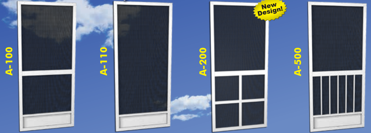
Doors shown with kickplate are 8". 18/14 charcoal screen standard.